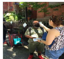
Protecting our volunteers and clients!

We need your help especially this Thanksgiving and Christmas!