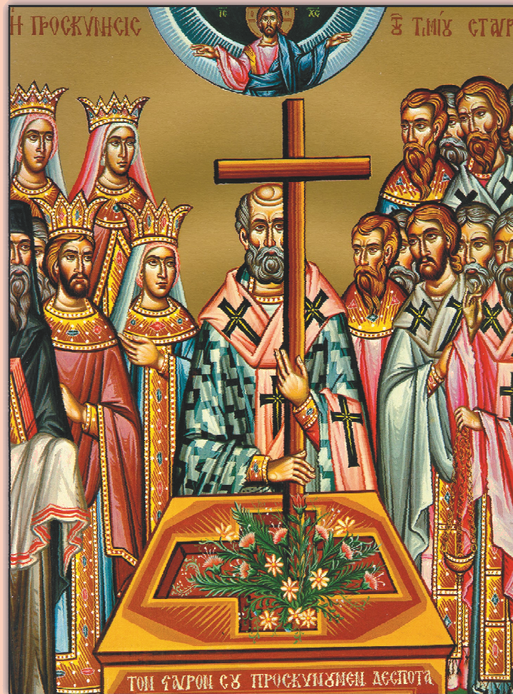
Icon of the Sunday of the Holy Cross

Have you seen the wonderful victory? Have you seen the splendid deeds of the Cross? ... Who can tell the Lord's mighty deeds? By death we were made immortal: these are the glorious deeds of the Cross.