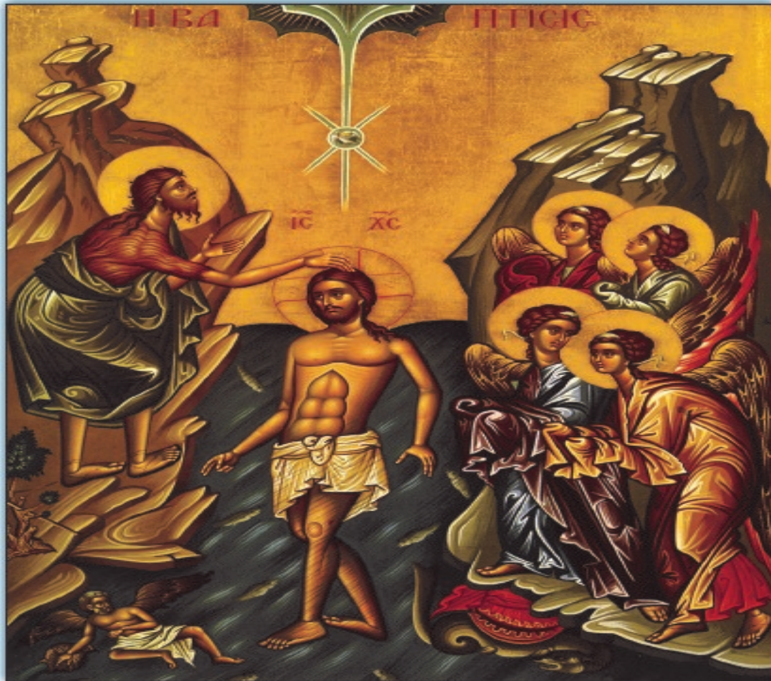
Icon of Theophany -- January 6th