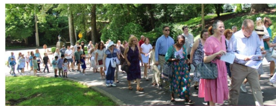
Corpus Christi Procession

Mass & Coffee: Thursdays, 9am July 9: Bonfire & Water Games Aug 1: Fall Retreat & Registration Aug 9: High School Family Picnic Aug 24: Donut Sunday at St. Mary