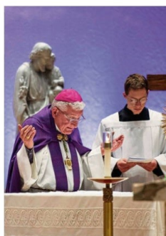
Stations with Bishop Zubik

Identify parishioners' skills and interests to plan age-focused and intergenerational events.