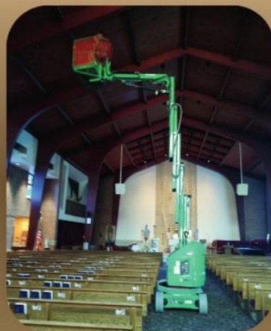
Bulb replacement at Saint James