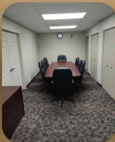
New boardroom at Meenan Center