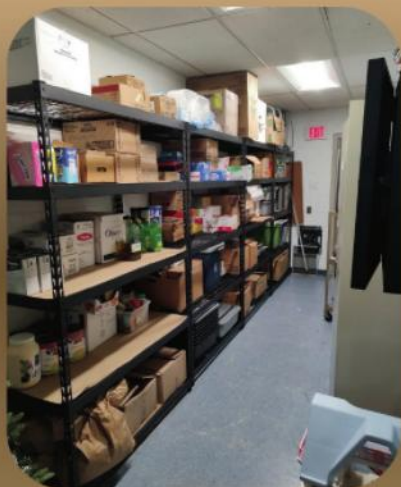
Reorganized space for fish fry supplies