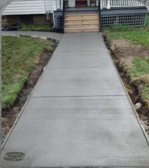
Sidewalk replacement at 242 Walnut Rectory