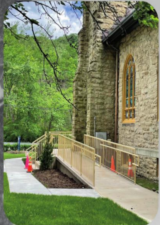
Sidewalks around new ramp at St. Mary Church