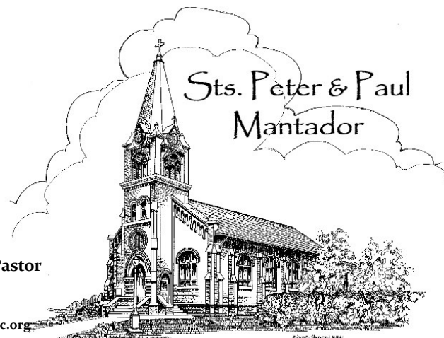
Sts. Peter & Paul Mantador