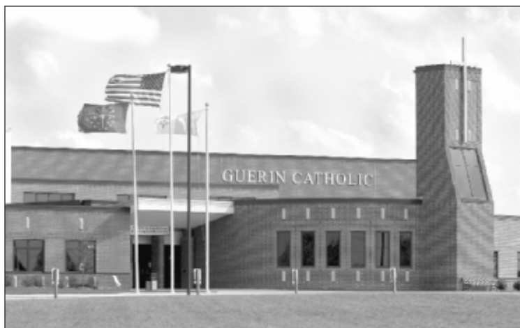
St. Theodore Guerin High School

I look back on my Guerin education as formation of my soul and brain. I have grown as a student of the subjects and as a student of Christ. My education has