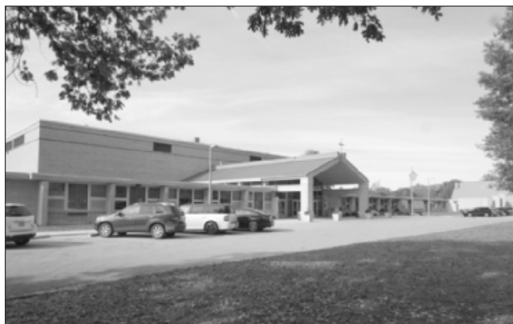
Central Catholic Junior-Senior High School

moment at Guerin was the opportunity to be a senior leader on the winter Junior Retreat. On this retreat I really felt a sense of community and was a witness to God's love.