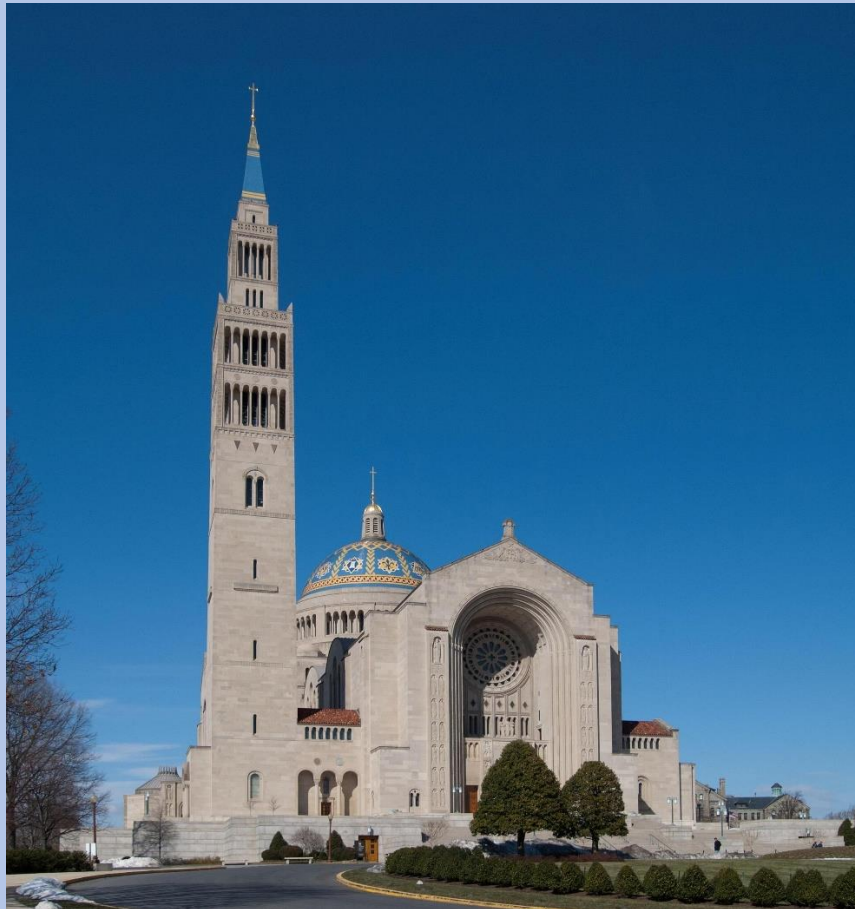
THE BASILICA of the NATIONAL SHRINE of the IMMACULATE CONCEPTION

...But be filled with the Spirit, as you sing psalms and hymns and spiritual songs among yourselves, singing and making melody to the Lord in your hearts, giving thanks to God the Father at all times and for everything in the name of our Lord Jesus Christ. – Ephesians 5:18-20