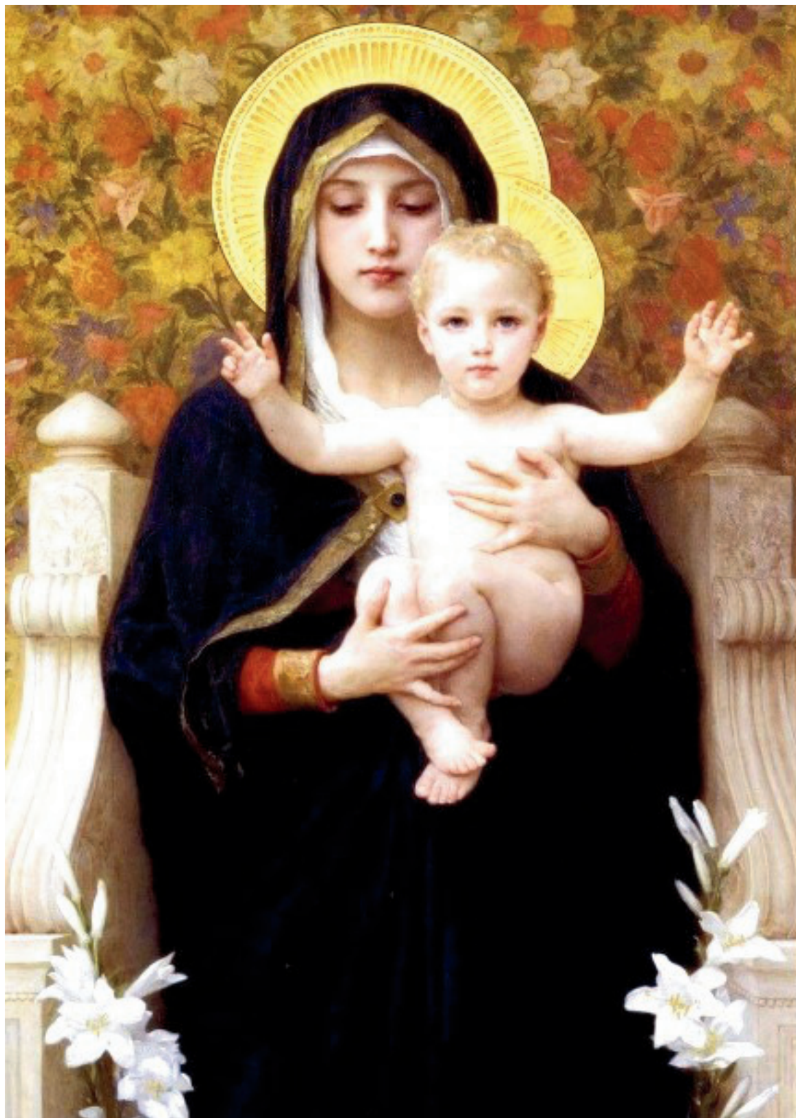
"The Madonna of the Lilies"