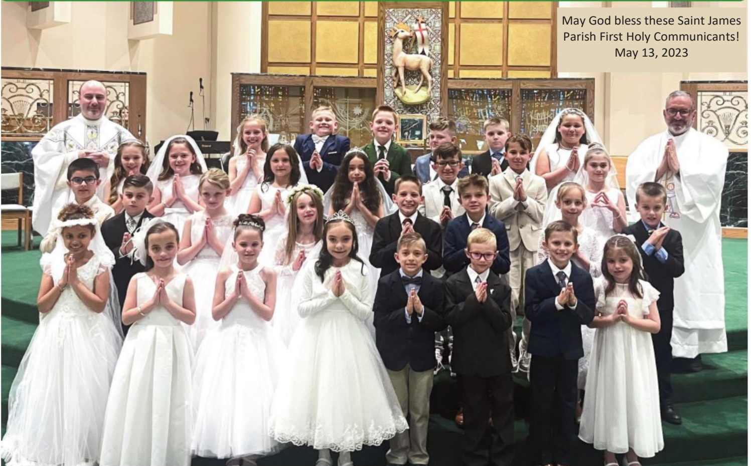
May God bless these Saint James Parish First Holy Communicants! May 13, 2023