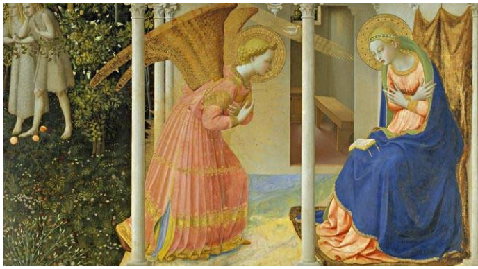
Fresco by Fra Angelico

Collection for December, 12-13, 2020: ..... $ 2,472.00 Youth Collection : .....$ 47.00 Christmas Flowers: .....$ 100.00 Retirement religious fund: .....$ 475.00