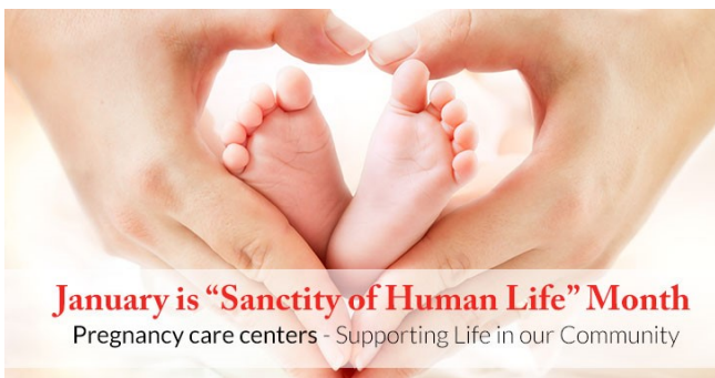
January is "Sanctity of Human Life" Month Pregnancy care centers - Supporting Life in our Community

January is Sanctity of Life Month. We support the work of the Laurel Life Center. Please note the items they are collecting during January. Sign up on Kiosk.