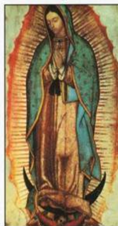
Protectress of the Unborn

During month four, the baby's brain begins to mature and its taste buds begin to work. Three hundred quarts of fluid per day are sent to the baby through the umbilical cord. Fine hair begins to grow on the baby's head, eyebrows and eyelashes. Facial expressions similar to the baby's parents can be seen at this time.