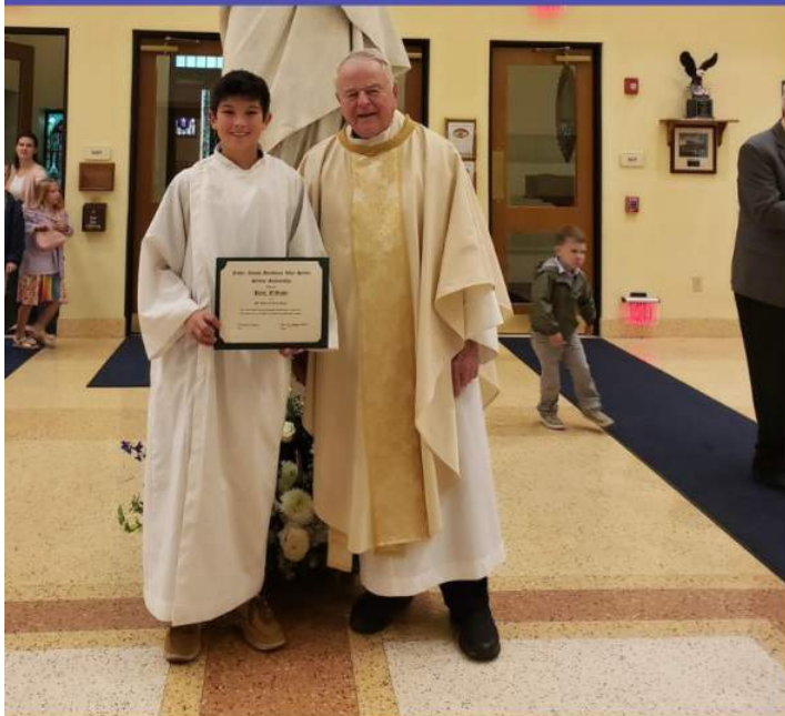
First Annual Father Josphed Dieckhaus Altar Service Scholarship