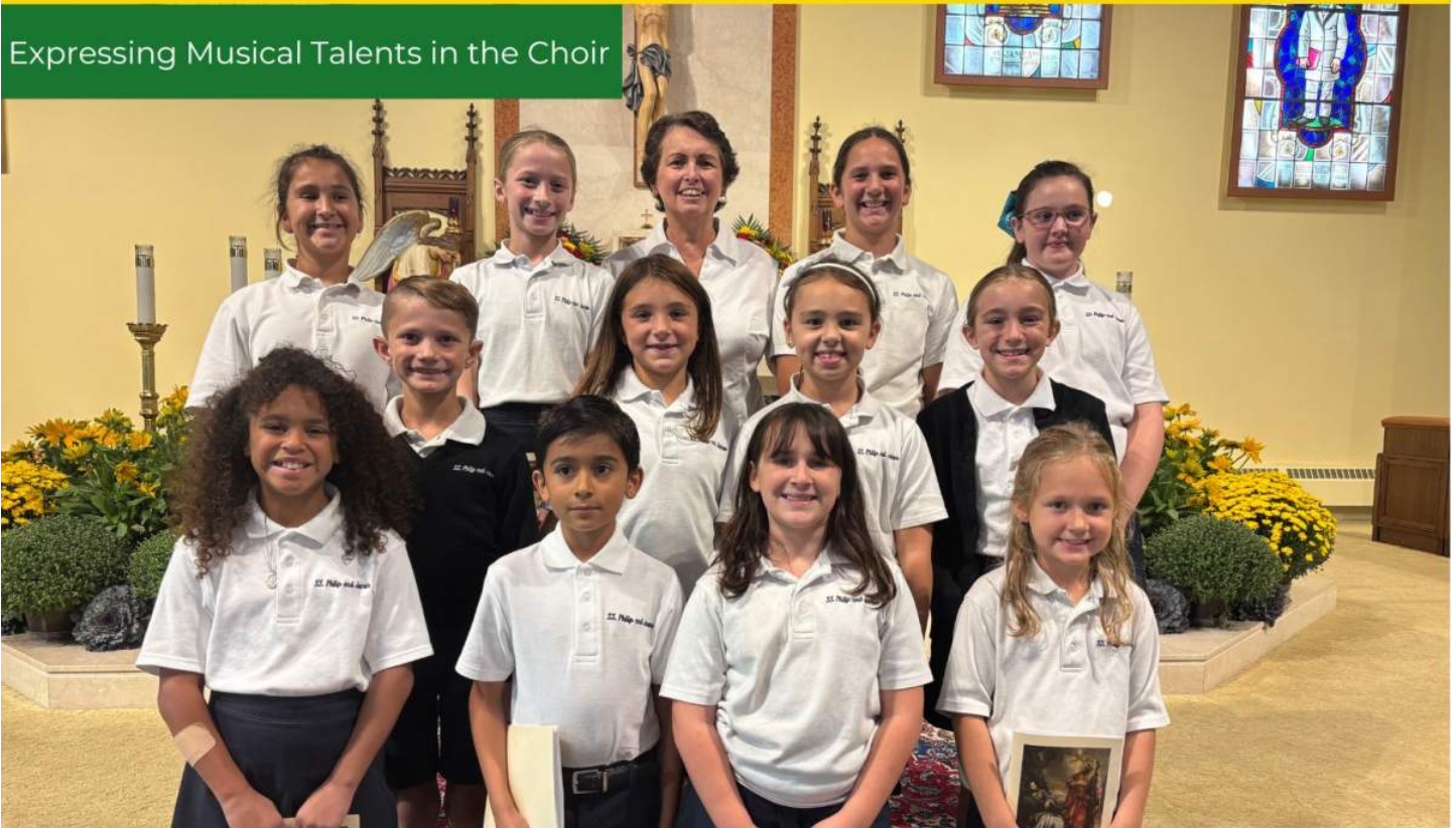
Expressing Musical Talents in the Choir

Awaken the intellect. Embrace the soul. Illuminate existence. Embrace the transformative power of a Catholic Education today!