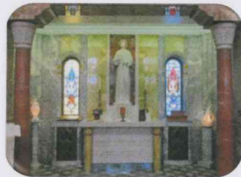
Mother Seton's tomb inside the basilica.