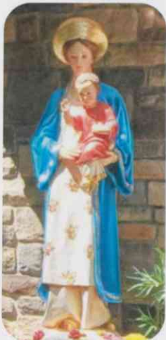
Our Lady of La Vang