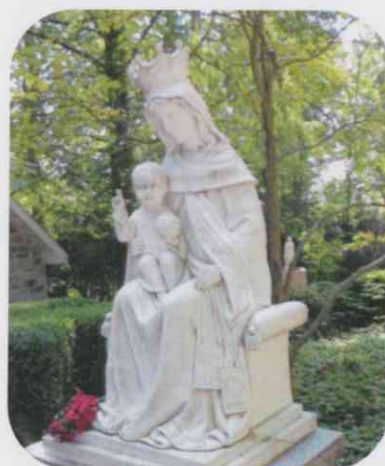
Our Lady of Mount Carmel