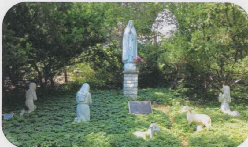
Blessed Mother with the Children of Fatima Francisco Marto, Lucia Marto, Jacinta Marto