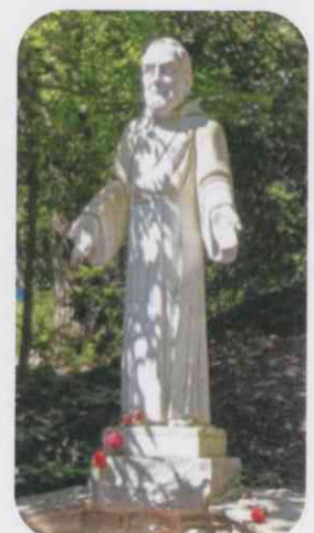
Saint Padre Pio