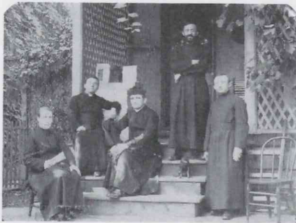
THE BEGINNING OF THE SOCIETY OF THE DIVINE WORD IN AMERICA 127 NORTH FRONT STREET, MILTON, PA.