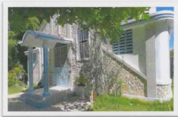
Immaculée Conception Church