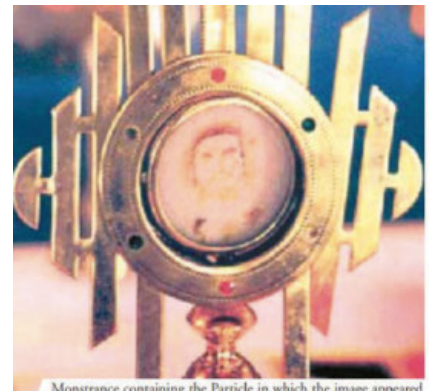
Monstrance containing the Particle in which the image appeared