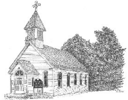
Holy Name Of Mary Proctorsville, VT