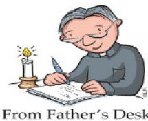
From Father's Desk

The Valentine's Day cards, candy and decorations appeared on the shelves at Hobby Lobby on December 27th. We live in a culture of anticipation when it comes to holidays, so the retail world likes to capitalize on our impatience, selling Valentine's candy six weeks in advance, as well as Hallows' candy in late August, likely hoping that we'll purchase it, consume it and then return for more when the holiday eventually arrives. I didn't fall for it this time, and left it there. I hope I can find those little conversation hearts when I get to the drug-store.