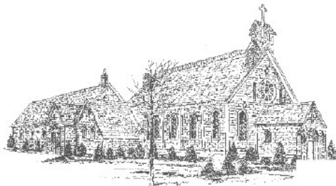
Church of the Annunciation Ludlow, VT