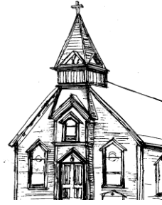
St. Patrick's Church 1000 VT-100B, Moretown