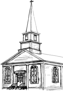
St. Andrew's Church 109 S. Main Street, Waterbury

Parish Office Hours: Monday, Wednesday, Thursday, Friday 9:00 am – 5:00 pm