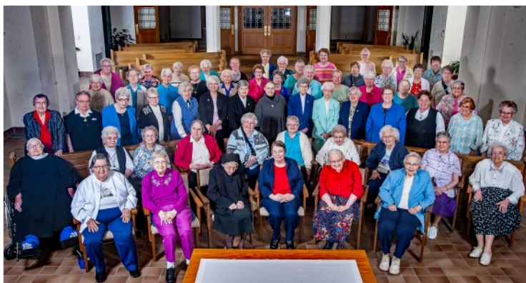
The Benedictine Sisters of St. Scholastica Monastery Duluth, MN