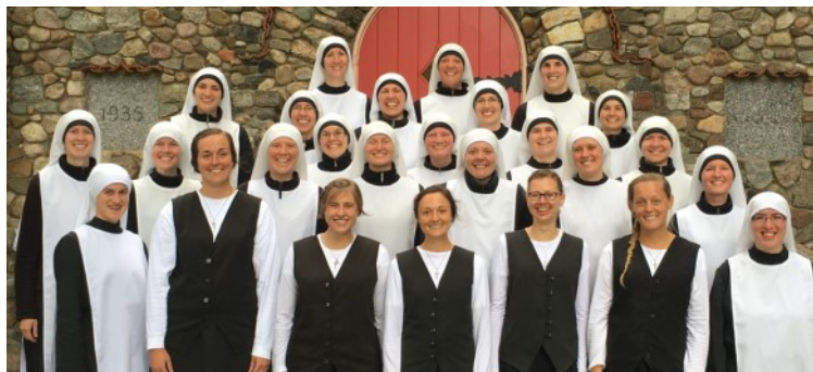
Handmaids of the heart of Jesus—New Ulm & Duluth, MN

Almighty Father, we beg you for an increase in religious vocations and holy marriages in our diocese. Help us to be generous in our response to Your call. Choose from our homes those who are needed for Your work and strengthen us with the courage to say "yes" and to follow You. Help us as a diocese, as a parish, as families to encourage and foster vocations to the priesthood, permanent diaconate, and consecrated life. We commend our prayers to our patroness, Mary, Queen of the Rosary, and ask this through Jesus Christ our Lord. Amen.