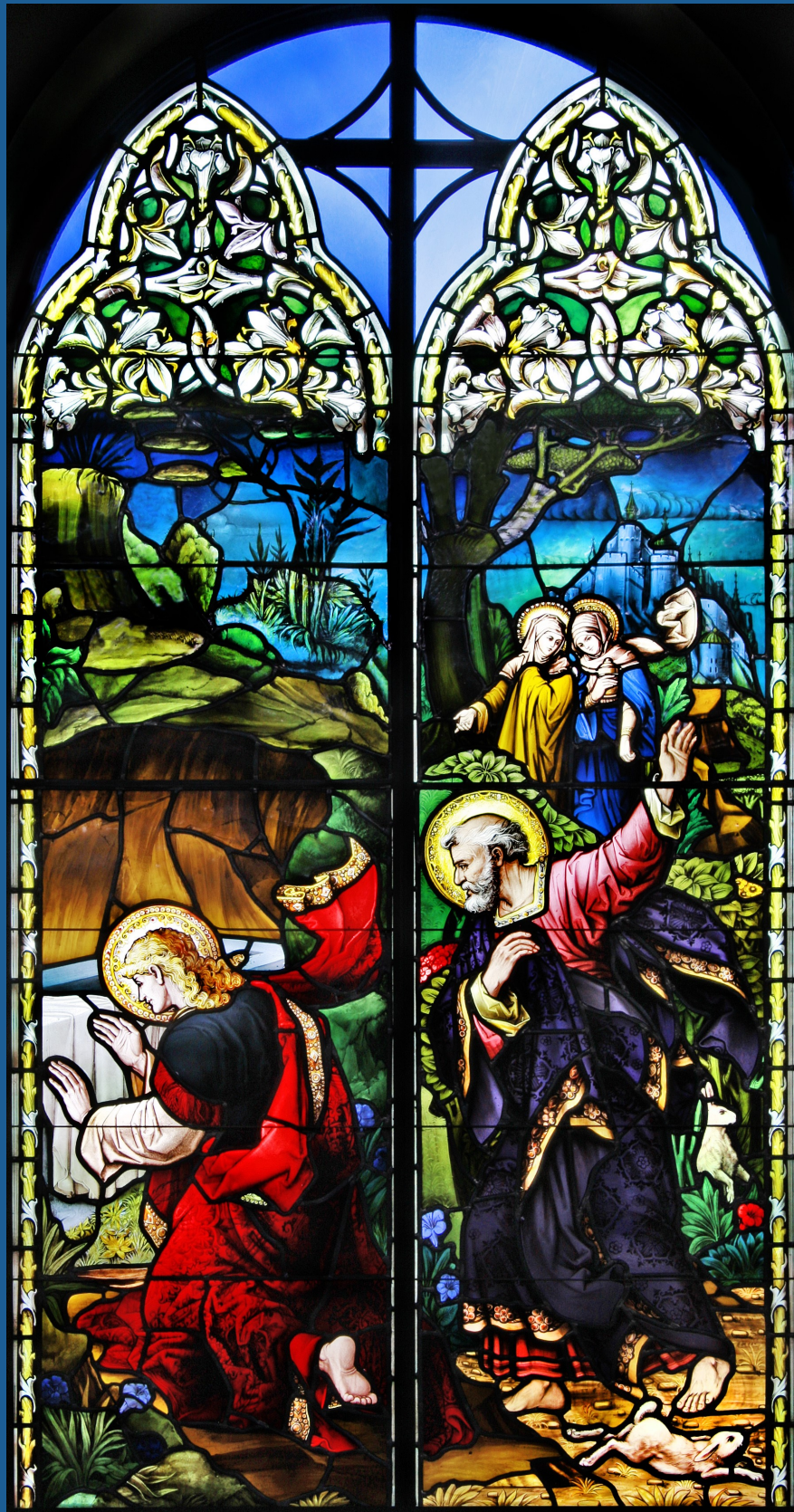
Stained Glass Window of The Empty Tomb -John 20:1-6 St. Peter Church in North St. Paul