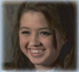
One of our birth mothers

"When I placed my baby for adoption I never considered myself any less a mother than raising my own child. I feel like being a mother you need to set aside your own feelings and your actions and what you want to do in life, put those aside and put your child's needs and feelings first."