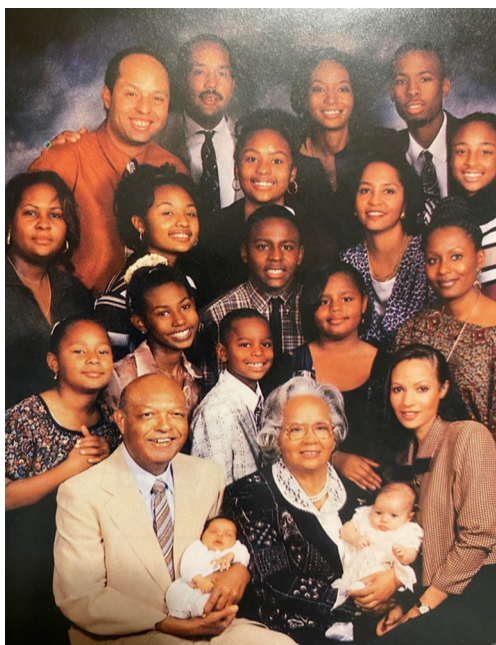
The Wright Family