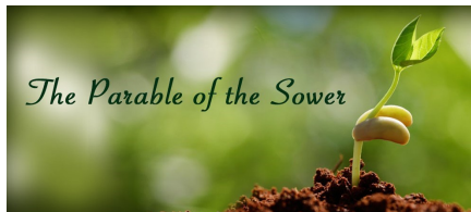
The Parable of the Sower

The parable of the Sower warns us of circumstances and attitudes which can keep anyone who has received the seed of the gospel message from bringing forth a goodly harvest. Jesus explained that “the good ground are they, which in an honest and good heart, having heard the word, keep it, and bring forth fruit with patience” (Luke 8:15). We have the seed of the gospel word. It is up to each of us to set the priorities and to do the things that make our soil good and our harvest plentiful. We must seek to be firmly rooted and converted to the gospel of Jesus Christ.