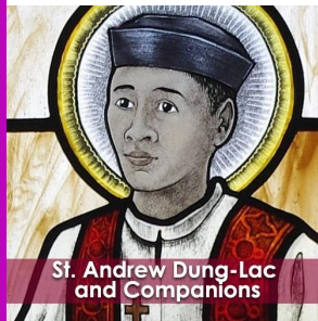
Sf. Andrew Dung-Lac and Companions

You need not be an existing EMC. Training will only take a few minutes of your time.