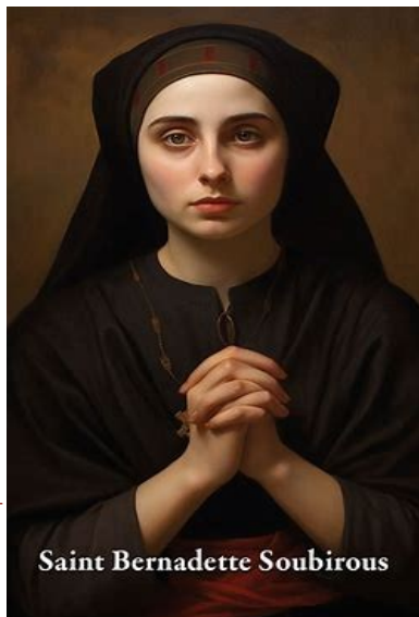
Saint Bernadette Soubirous