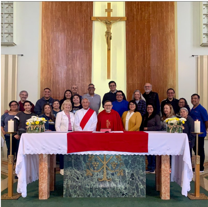
Photograph of the Cooperators at Saint John Bosco Chapel at the culmination of their Annual Spiritual Retreat

Don Bosco founded the Cooperators himself and the association was approved by the Holy See in 1876. Cooperators are the essential lay component of the Salesian Family. They live their normal daily lives in the world; they are parents, teachers, employees in any and all careers, volunteers, students - anyone desiring to live the Gospel in a dedicated way according to the charism given to St. John Bosco.