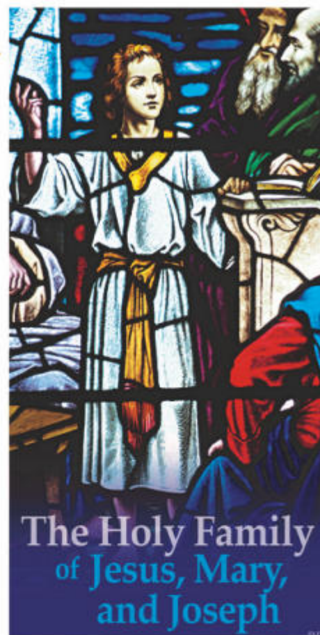
The Holy Family of Jesus, Mary, and Joseph

While families come in all shapes and sizes and no two are the same, they all need a common focus and grounding. Families are intended to be pivotal in providing us with a proper social structure and understanding, a support system, lessons about relationships and communication and the unconditional acceptance and love we so desperately crave. In addition to all of these things, the axis of every family has to be centered on faith. It is here that we can learn about the virtues and discover the windows to God Himself in His gifts of faith, hope, and love. We can learn, modeling our experience after the Holy Family, how to use these as anchors in our lives so that we can live out the other virtues with greater integrity. Because our human families struggle with weakness and sin, we have to come back to the Holy Family often for inspiration and guidance. In the bond of love that they shared, they clung to the anchor of God Himself and endured challenges far greater than many we will ever face.