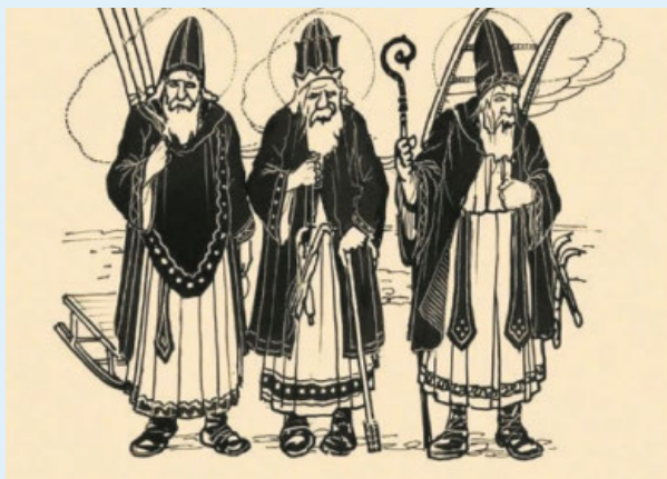
The "Three Freezing Saints"

Medieval Christians likened these three saints to pranksters lurking in their vineyards and orchards, capable of causing havoc with their way of life. Today we might find a new kind of menace foraging in our technology-driven culture. Such threats are the internet predators, cyber stalkers, malicious computer viruses, and identity thieves. Rather than frost stifling the life of a plant, these pernicious entities reach out from the anonymity of dark places and foil human lives. The motivation for their cruelty is beyond my comprehension. Many parishioners at St. Peter have gotten email solicitations from someone using my name asking for a favor, like buying gift cards. On a larger scale, such devious enterprises can cripple a family's finances, destroy the hard work of an honest business or even harm emotionally an elder person who innocently complies with these requests.