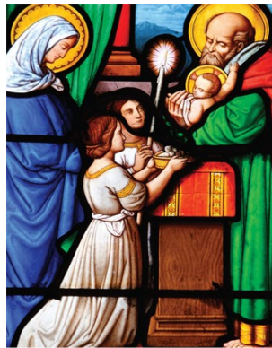
The Presentation at the Temple WORLD DAY FOR CONSECRATED LIFE

The World day of prayer for Consecrated Life is also the feast of the Presentation of the Lord. Celebration of this day of prayer is to allow parishes to highlight the gift of religious life and pray for those discerning a religious vocation.