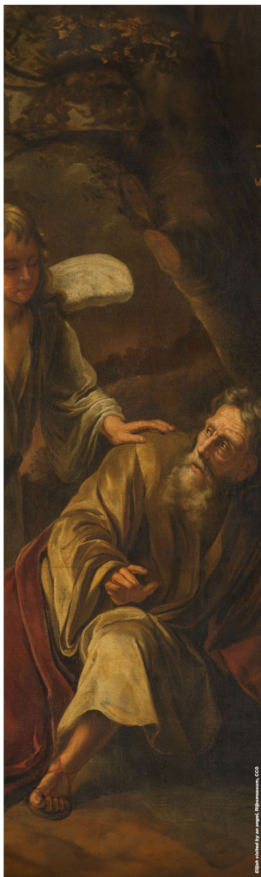
Elijah visited by an angel

SERVE Think of someone you know who is struggling right now. This week bring this person some food or drink. Say a prayer for and with them. You'll be a messenger of God's redeeming love, offering nourishment for the spirit and soul as well as the body.