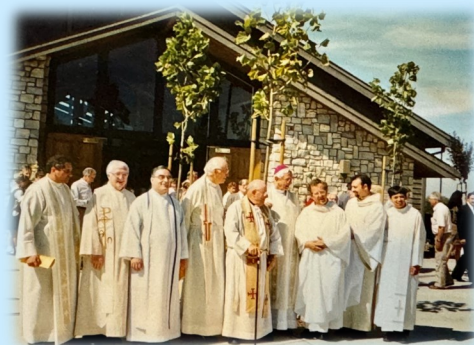
On the day of the consecration of our church