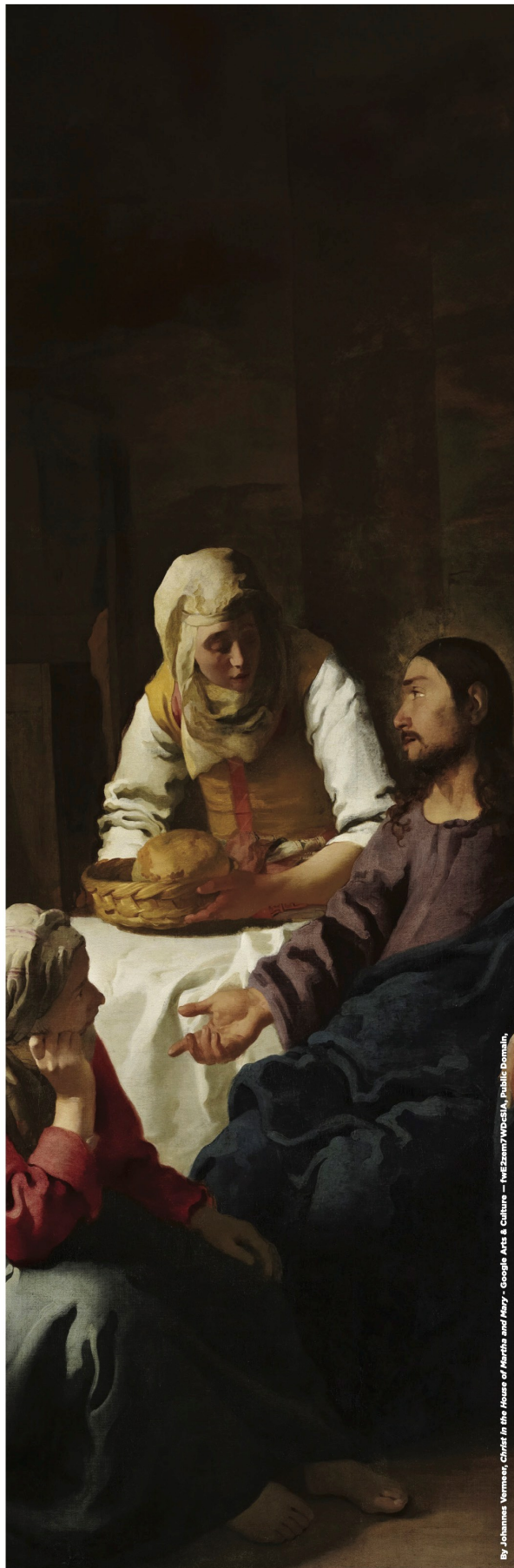
By Johannes Vermeer: Christ in the House of Martha and Mary