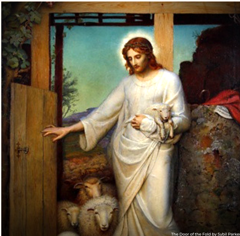
The Door of the Fold by Sybil Parker

FOR ALL OTHER SACRAMENTS PLEASE CALL THE PARISH OFFICE TO MAKE AN APPOINTMENT