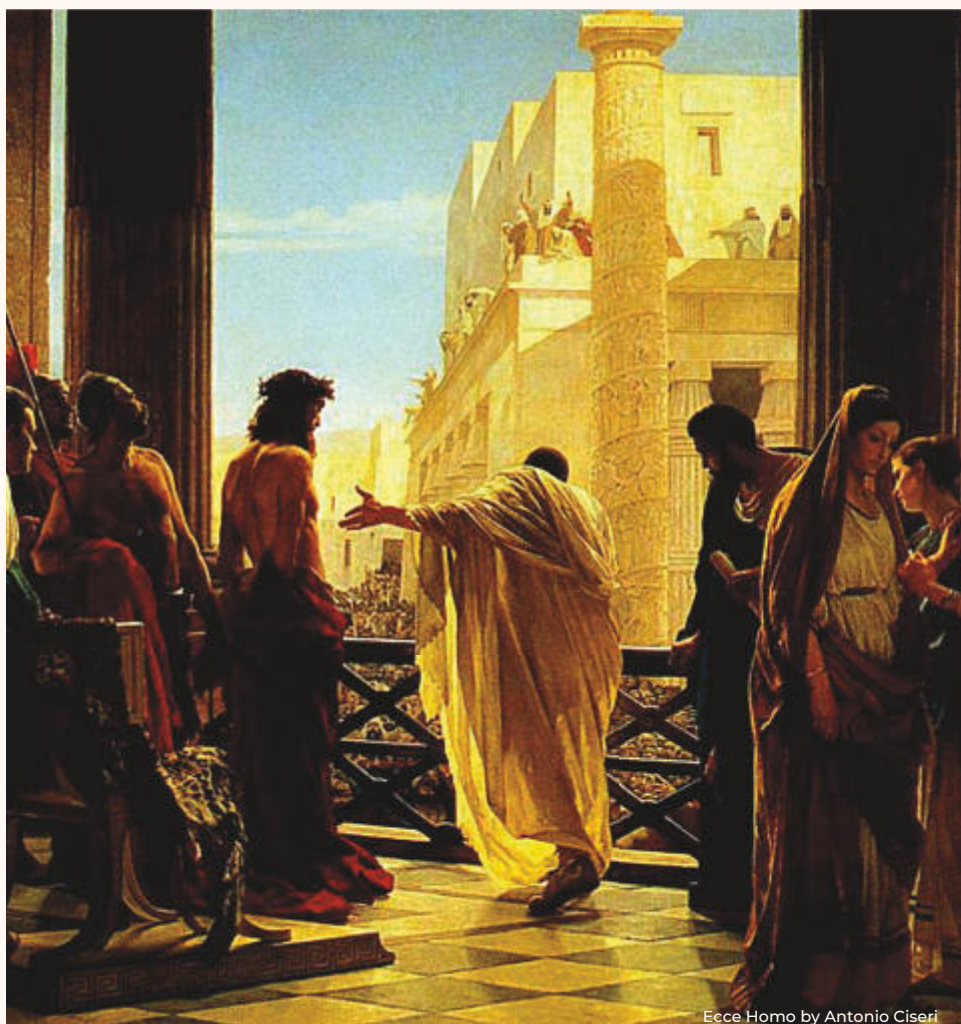
Ecce Homo by Antonio Ciseri

FOR ALL OTHER SACRAMENTS PLEASE CALL THE PARISH OFFICE TO MAKE AN APPOINTMENT