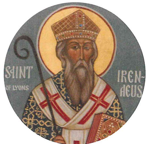
Memorial of Saint Irenaeus, June 28th

The council will promote the best interests of the parish and make recommendations for its good management and proper development. If you have an item you'd like to bring to the council, please contact the parish office or a member of the parish council to be added to the agenda for a particular meeting.