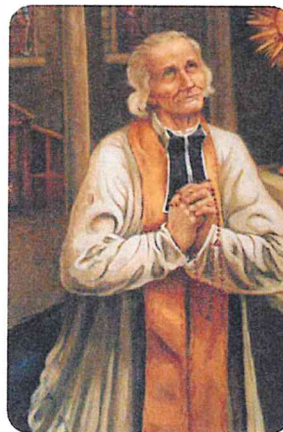
St. John Vianney, August 4th

For more information, email cemetery@stthomascda.org .