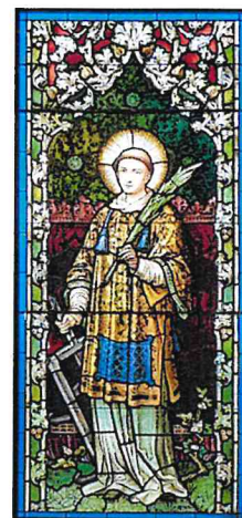
St. Lawrence, August 10th

find us on Youtube, Facebook and Instagram @stthomascda