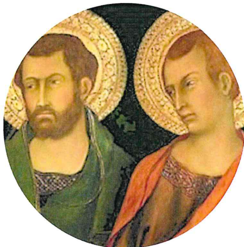
Sts. Simon & Jude, October 28