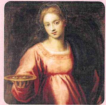
St. Lucy, December 13th