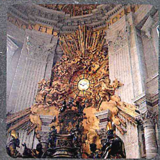
Chair of St. Peter, February 22

919 E. Indiana Ave. Coeur d'Alene, Idaho P. 208.664.9259 | W. stthomasda.org