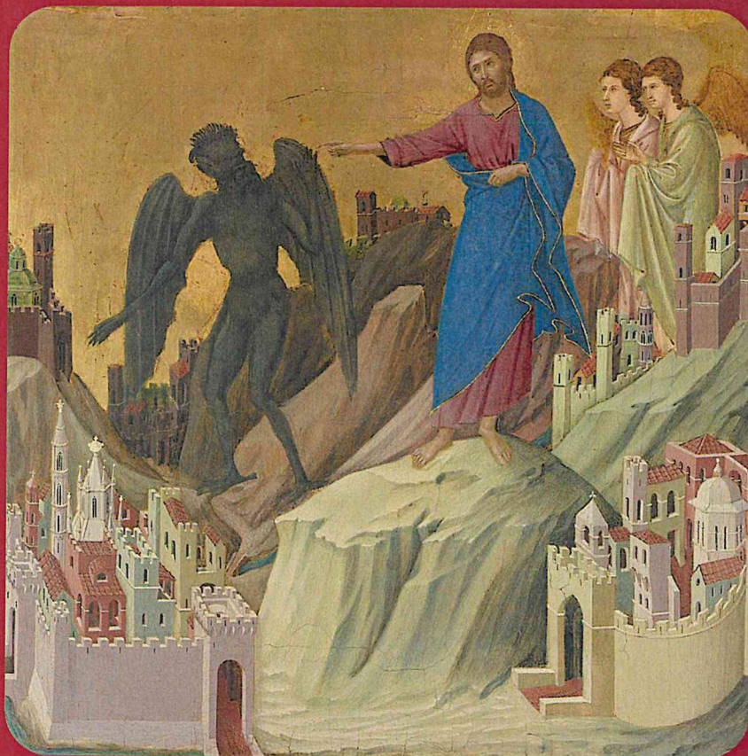
The Temptation on the Mount, Duccio, 1311

919 E. Indiana Ave. Coeur d'Alene, Idaho P. 208.664.9259 | W. stthomasda.org