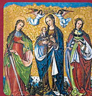
Sts. Perpetua and Felicity, March 7