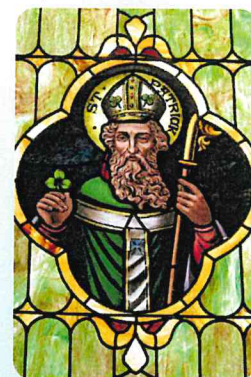
St. Patrick, March 17