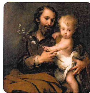
Solemnity of St. Joseph Saturday, March 19th 8am Mass