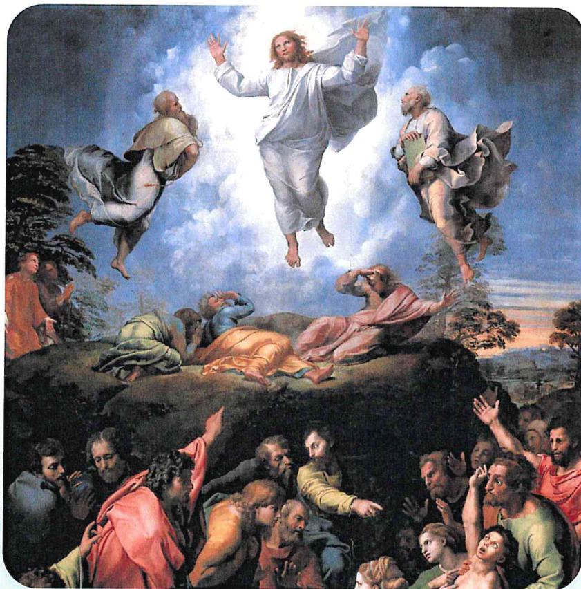
The Transfiguration, Raphael 1520

919 E. Indiana Ave. Coeur d'Alene, Idaho P. 208.664.9259 | W. stthomascda.org