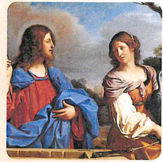
Jesus and the Samaritan Woman, Guercino Jn 4:5-42