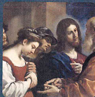
Jesus and the Woman Taken in Adultery, Guercino Jn 8:1-11

919 E. Indiana Ave. Coeur d'Alene, Idaho P. 208.664.9259 | W. stthomascda.org