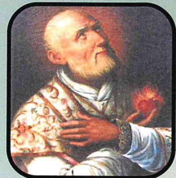
St. Philip Neri, May 26th

919 E. Indiana Ave. Coeur d'Alene, Idaho P. 208.664.9259 | W. stthomascda.org